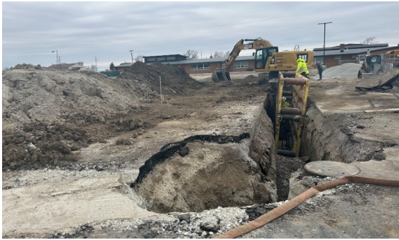
Construction of the new Marion Local Junior High building continues throughout the winter months.